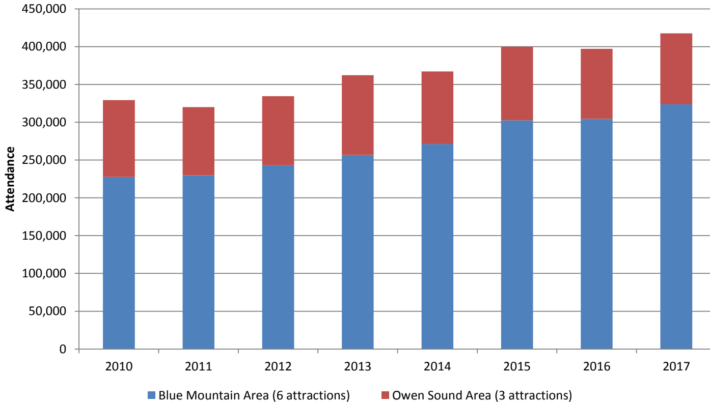
Grey County Gated Attractions 2010-17