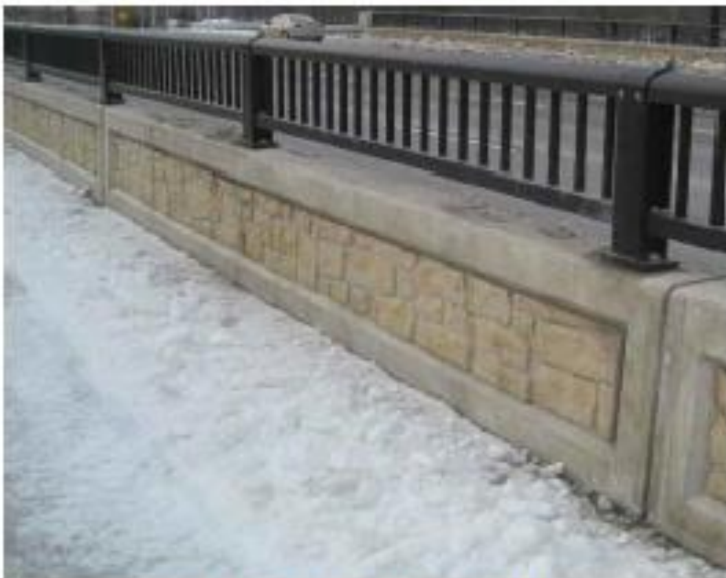
IMPRESSCRETE ARCHITECTURAL FINISH