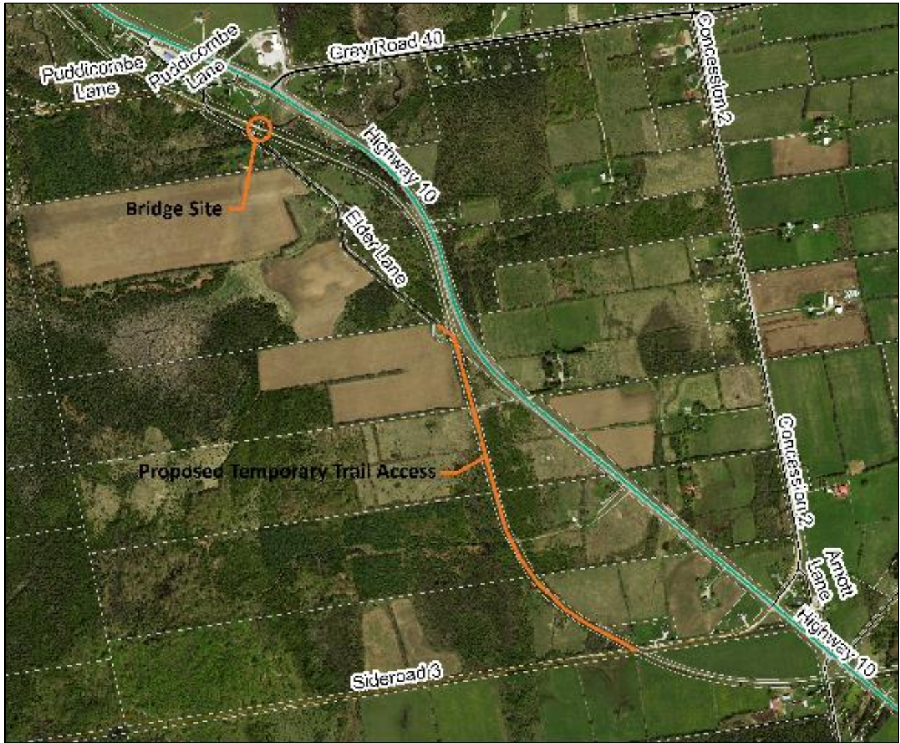
Map 1: Airphoto of the Subject Property and Surrounding Lands

County staff received a request from the Township of Chatsworth to use a portion of the CP Rail Trail for access purposes, while a bridge is replaced on Elder Lane. County and Township staff have been working on this project for the past few years, and the Township has scheduled construction for later in 2020. The subject lands are located south of the former village of Chatsworth, on the west side of Highway 10. Map 1 below shows the subject lands, the bridge to be replaced, and the proposed temporary trail access. Map 2 provides more details on the works being done, and the three private properties that will be impacted during construction.