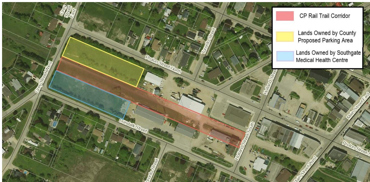
Figure 1 – Subject Lands

The County would need to maintain at a minimum the actual CP Rail Trail corridor in accordance with the County Official Plan. The CP Rail Trail corridor is approximately 25 metres in width (lands identified in red on Figure 1). The County Official Plan identifies that the County will retain the CP Rail Trail corridor not only for the current use as multi-use recreational trail but also in case rail were to ever return to Grey County. Based on the Official Plan policies, it will be important to include provisions in the agreement(s) with Southgate and/or the South East Grey Community Health Centre to note the potential for rail to return and if rail should return that features and amenities may need to be removed in order to accommodate rail. In speaking with County Legal staff, the legal aspects regarding rail can be quite complex and therefore we may need to engage a lawyer that specializes in rail in order to assist the County with respect to these matters. The County also currently leases land to Huron Bay Co-op within this block and therefore it would be beneficial to clearly identify the part that is leased through a surveyed reference plan.