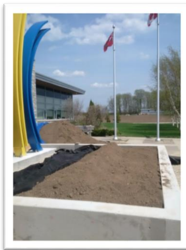
South side plantings.