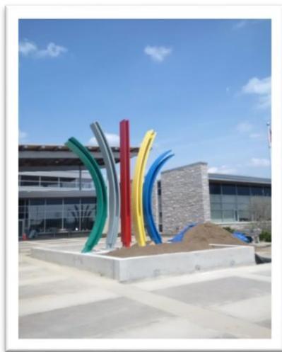
View from parking lot.

The colours contained in the Grey Roots logo represent: green = forests; grey = rocks; red = people; yellow = agriculture and blue = water. The logo integrates many of the concepts of the Interpretive Plan and symbolizes the stories and the strengths of the people of Grey County and their interaction with the elements.