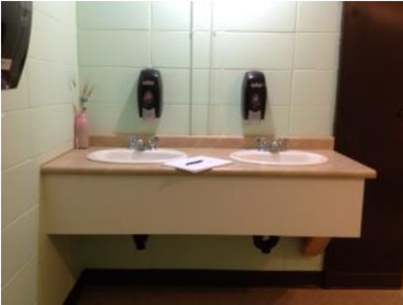
3 Cubicles in Downstairs Women's Washroom, not accessible: