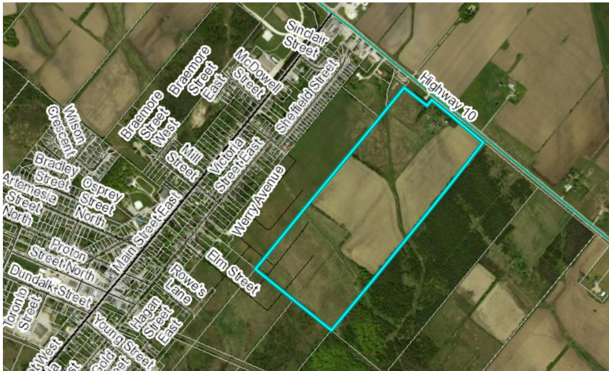
Figure 1: Subject Lands – Flato East

The revisions propose to: shift Block 361 servicing/access corridor from between Lots 98 and 99, to the east side of Lot 90 (shown as Block 374 on the proposed revised plan); enlarge the pumping station (Block 355); introduce a servicing easement/block between Lots 232 and Block 339 (shown as a 6 metre wide water service easement on the proposed revised plan); and associated shifting of townhouse Blocks 339 to 343 as a result of the proposed servicing easement/block. The total number of draft approved lots/units would remain the same (see Figure 2 and 3 – Excerpts of Proposed Revision Plan).