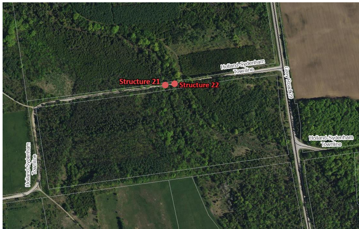
Figure 1: Map Showing Location of Structures 21 and 22

See Figure 1 below which shows the locations of Structures 21 and 22. Figure 2 shows an image of the structures looking from the Holland-Sydenham Townline.