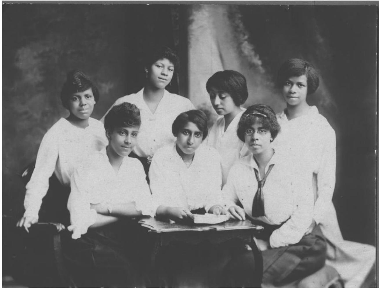
Young Ladies of the BME Church, 1920s