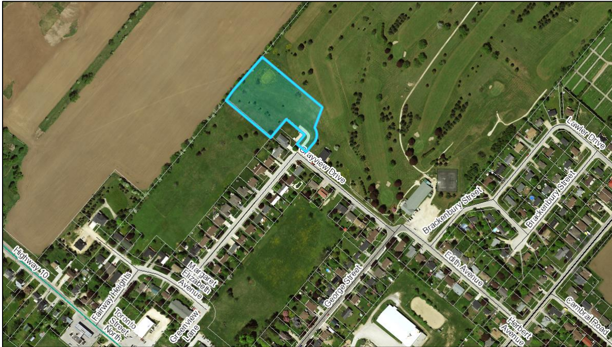
Map 1: Airphoto of Subject Lands

The County has received a plan of subdivision application, known as Stonebrook Phase II, that proposes to create 10 blocks, comprised of two new streets and 24 townhouse units. The proposed subdivision is located on Part of Lot 98, Concession 1, geographic Township of Artemesia, in the Municipality of Grey Highlands. The subject lands are approximately 1.2 hectares in size and are located in the northwest end of Markdale abutting the golf course. Map 1 below shows the subject lands and surrounding area, while Map 2 shows the proposed plan of subdivision.